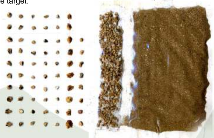
PPU Sinter bullet after impact into steel plate target

Everything is conventional and even better, only there are no bullet, no hole and no injuries due to fragmenting after the bullet impacts into steel plate target.